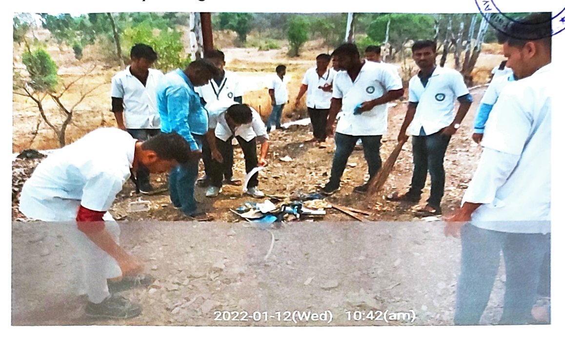
18/02/2022 Apati & Borpadale Village